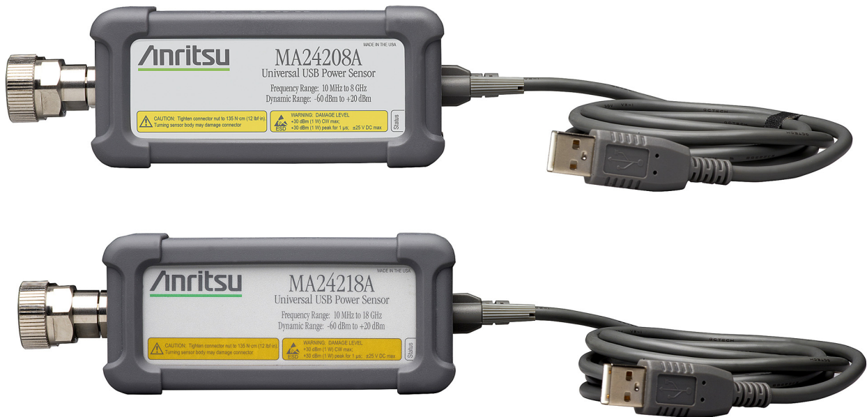
MA24208A and MA24218A Universal USB Power Sensors